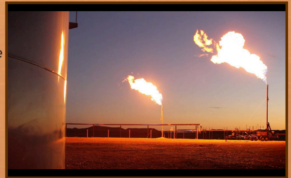
Mixing Oil & Water, 2015 Official Selection